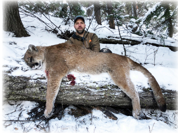
Lion hunts are epic!