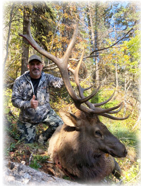
Great archery bull!