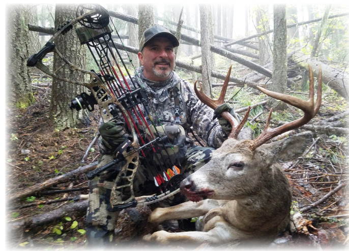
Spot and stalk whitetail buck in the timber. Great shot!