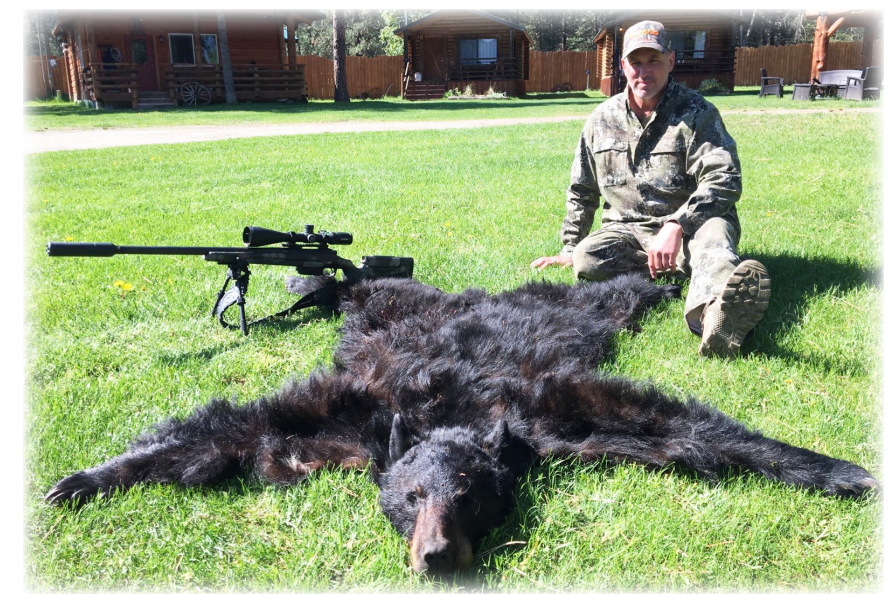
Time for reflection!