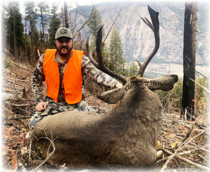
Good mule deer buck!