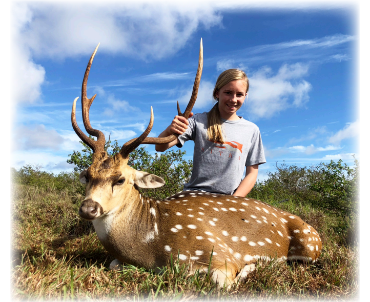
These two girls are my favorite clients! What a hunt in Hawaii for axis deer!