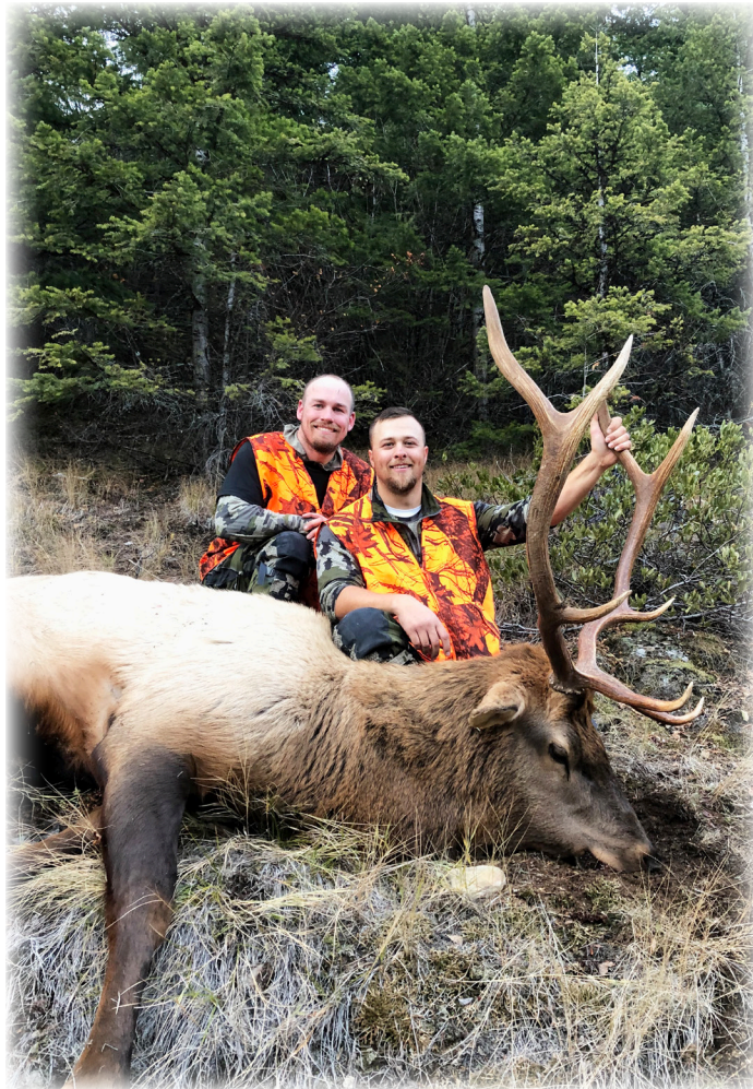
Will camped and crushed this bull elk in the backcountry!