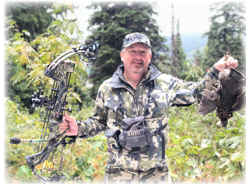
Anybody for lunch!