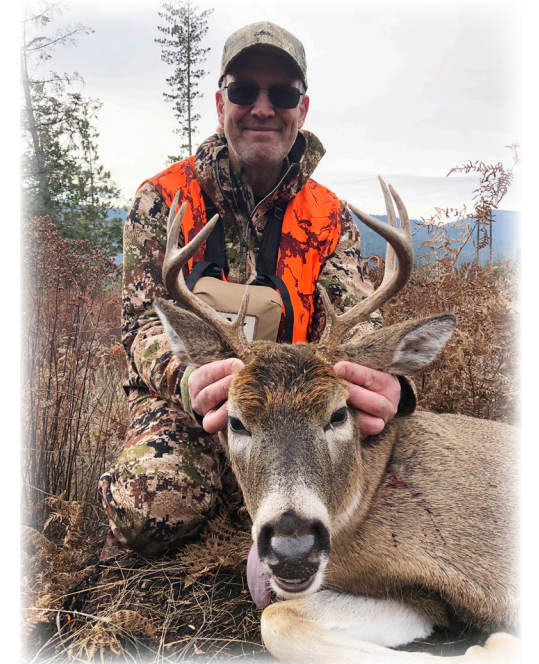
Nice little buck!