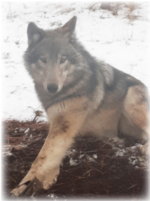
Nothing better than checking traps and finding this!