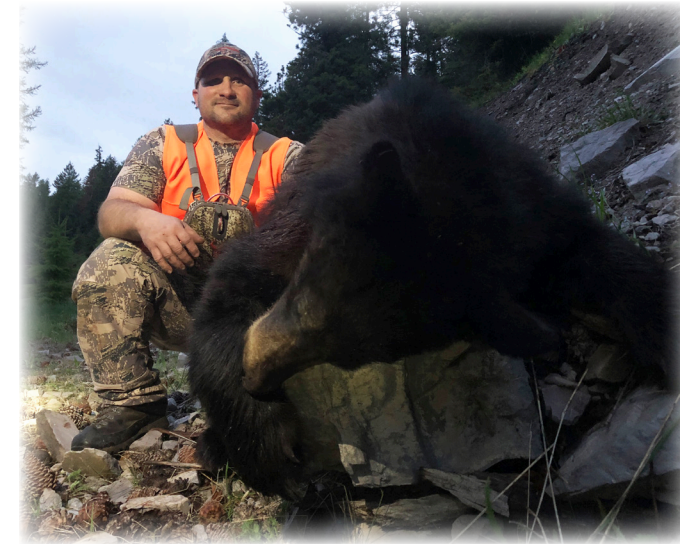
Taking home a black bear!