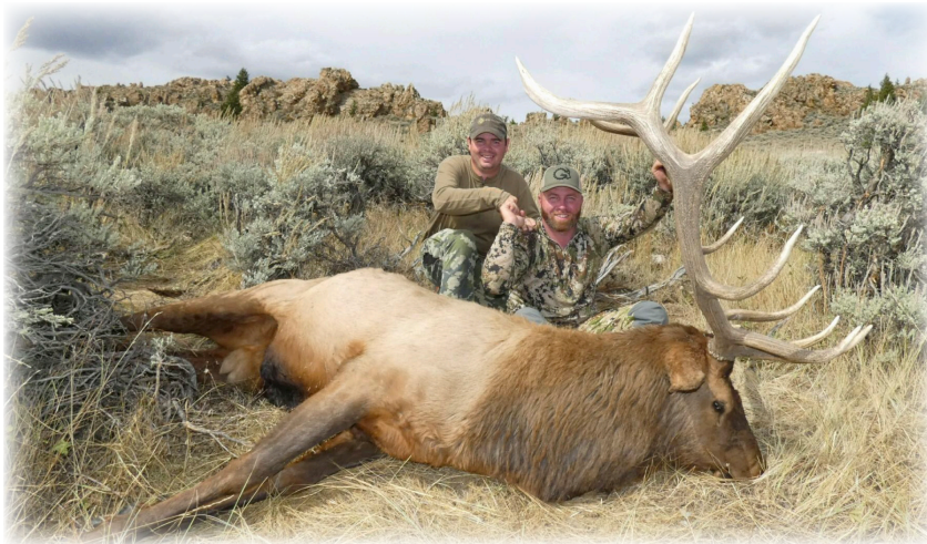
Lucky enough to fill another special tag!