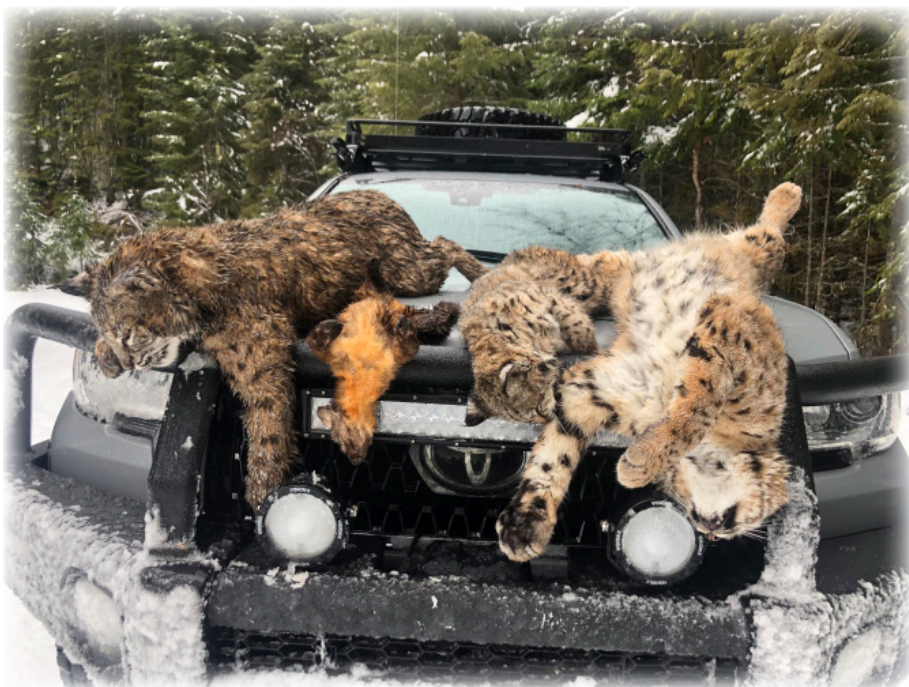
Great trapline check!