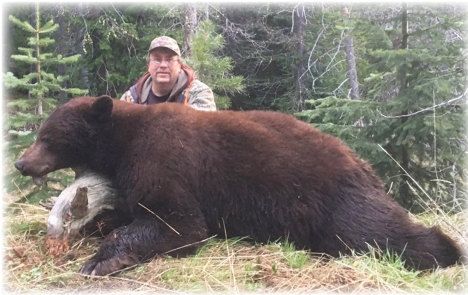
Beautiful colored bear!