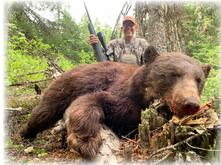
Beautiful bear! Montana has a lot of colored bears!