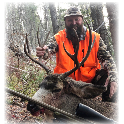
Filling tags on a good mule deer buck!