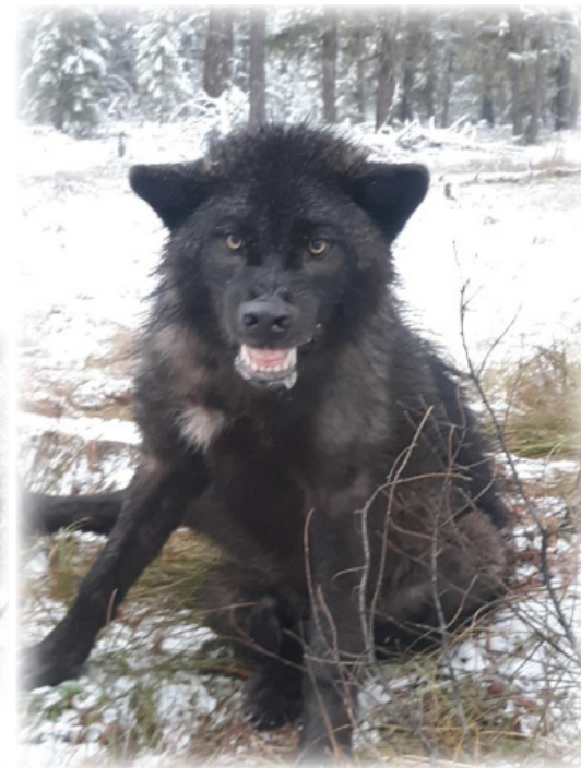
He's not happy!