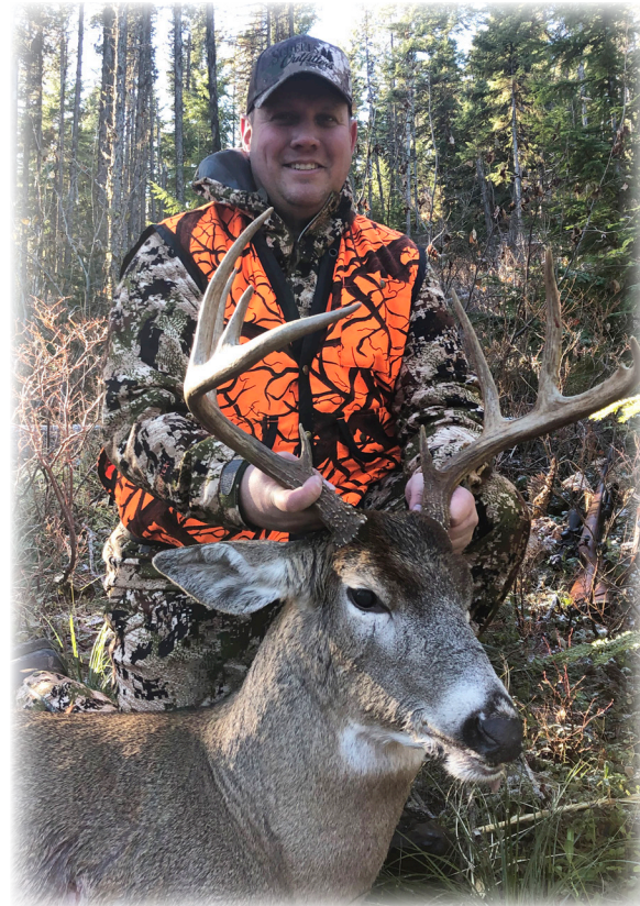
Both guys shot nice whitetail!