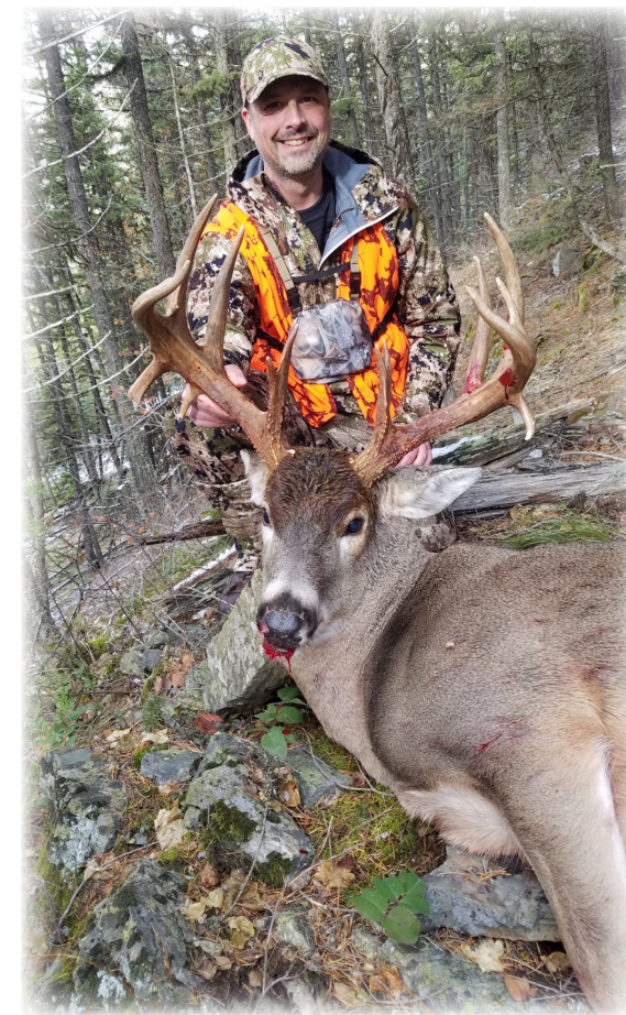
Triple droptiner! A deer of a lifetime!

All animals in this harvest report were harvested in the 2019 hunting season.