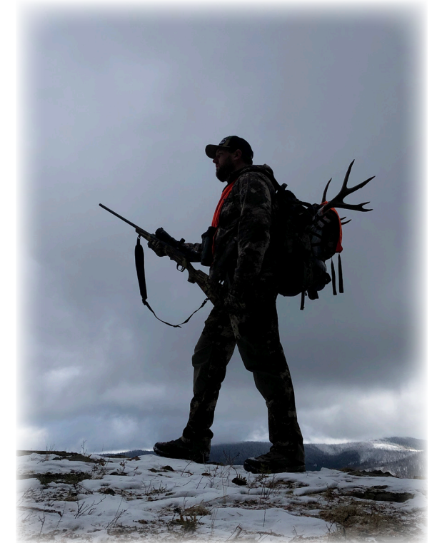
Go in light and come out heavy!