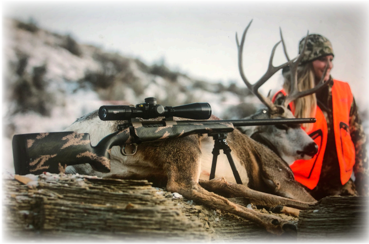
Koliss showing off the new Castle Rock OGL rifle.