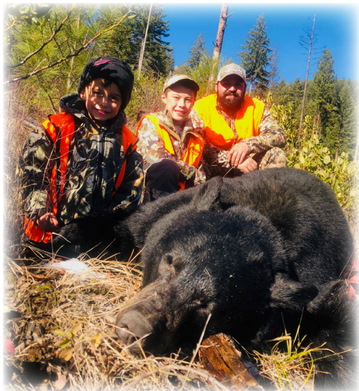
Nice father/son day!