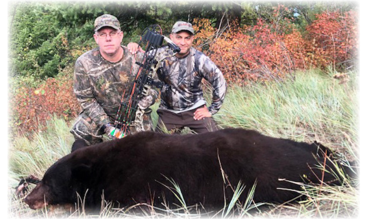
Great bear with a bow!