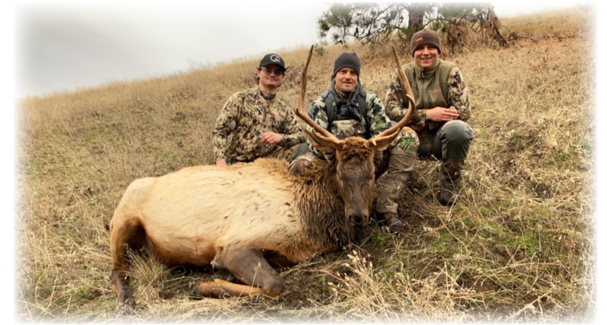
Last day bull elk! Great job!