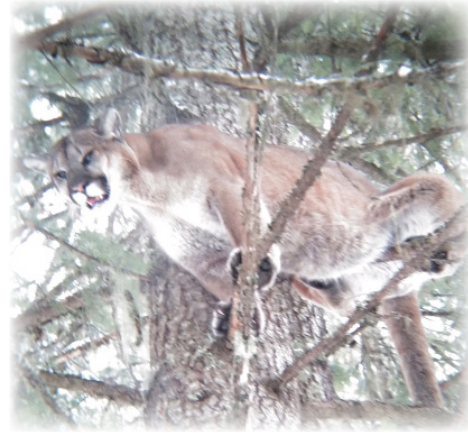
Beautiful tom treed!