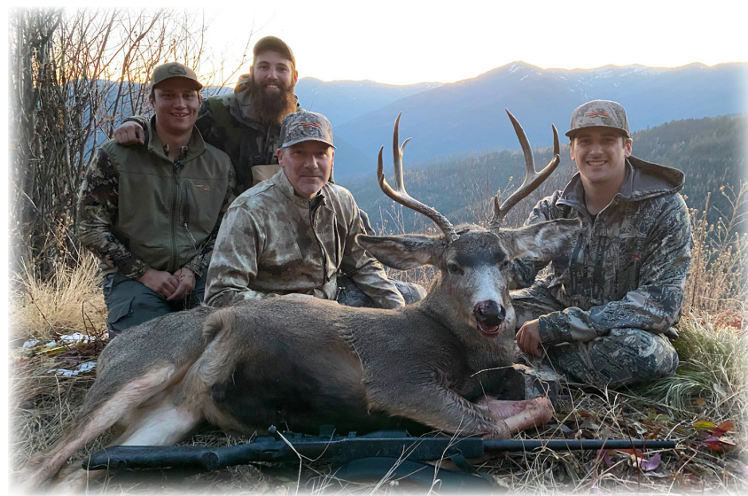
Cal Quantrill, MLB pitcher, threw his tag on his first mule deer buck!