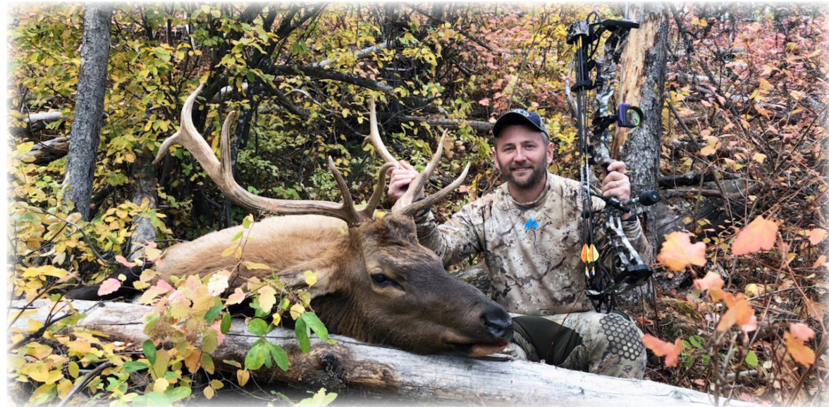
Great first archery bull!