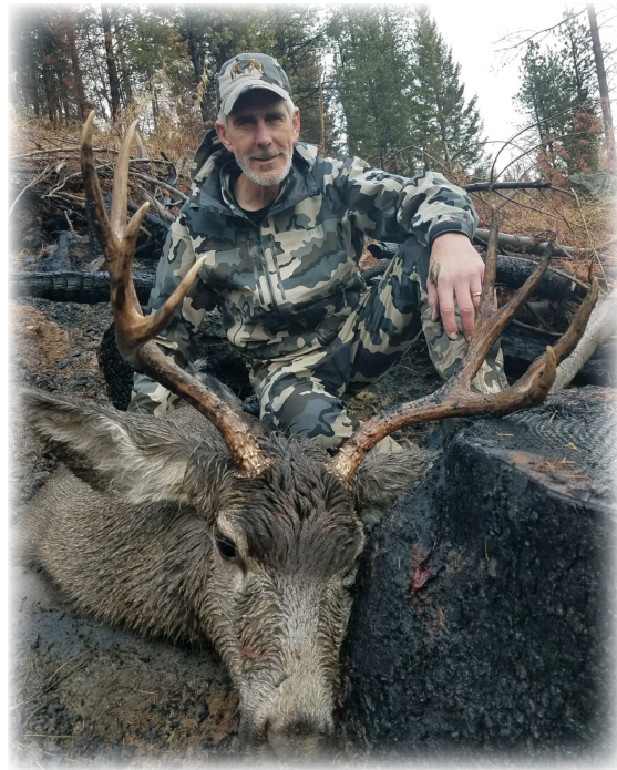
Bringing home some meat!