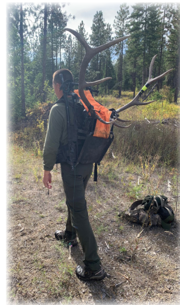
Recovering your bull is a great feeling!