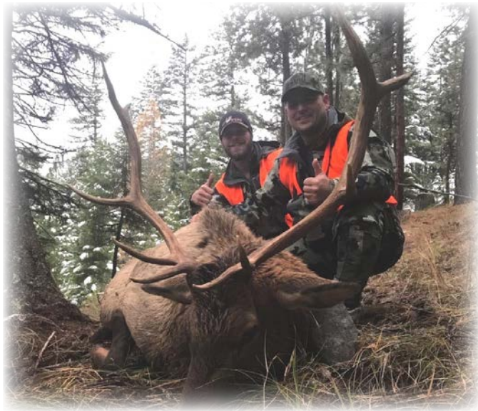
These two will be eating good this winter!