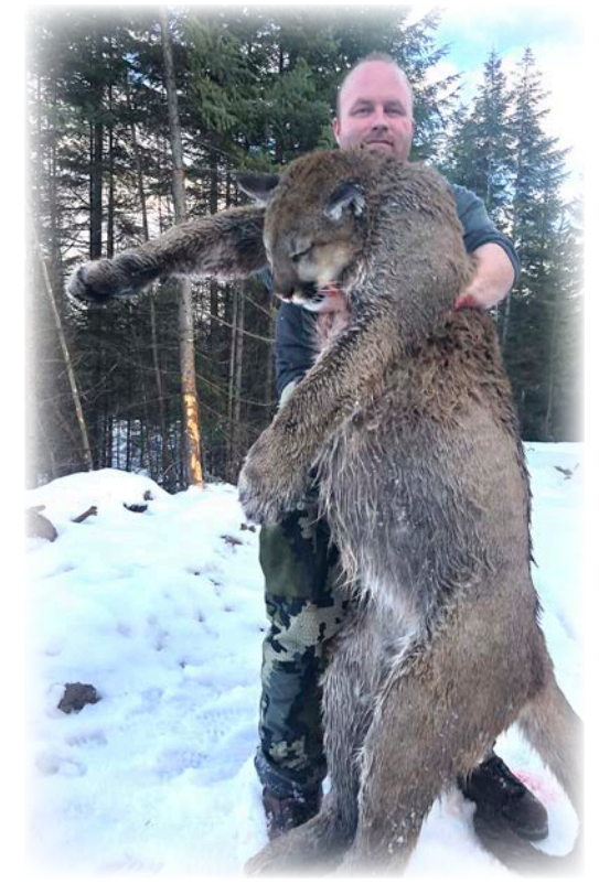
What an amazing Apex Predator!