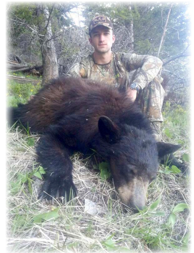
Excited to notch his tag on this bear!