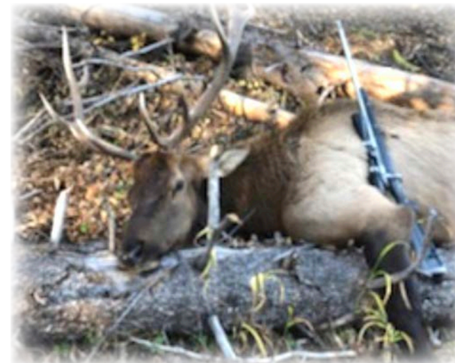
That rifle never looked better!