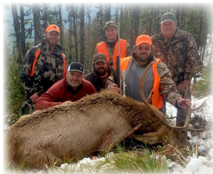
It was a group effort getting this bull down and out!