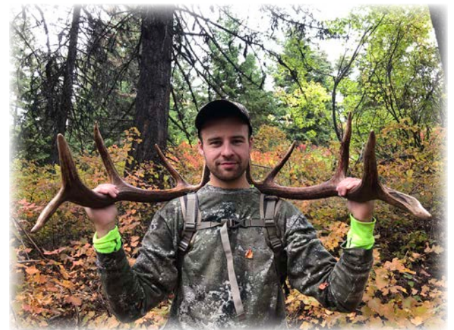
Harvesting a Montana Buck or Bull can be so rewarding!