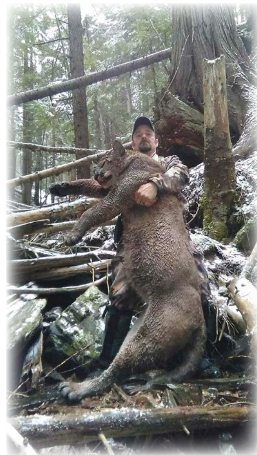
A Boone & Crocket Tom.