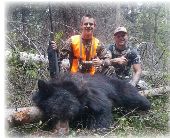
Killing bears and saving fawns & calf elk!