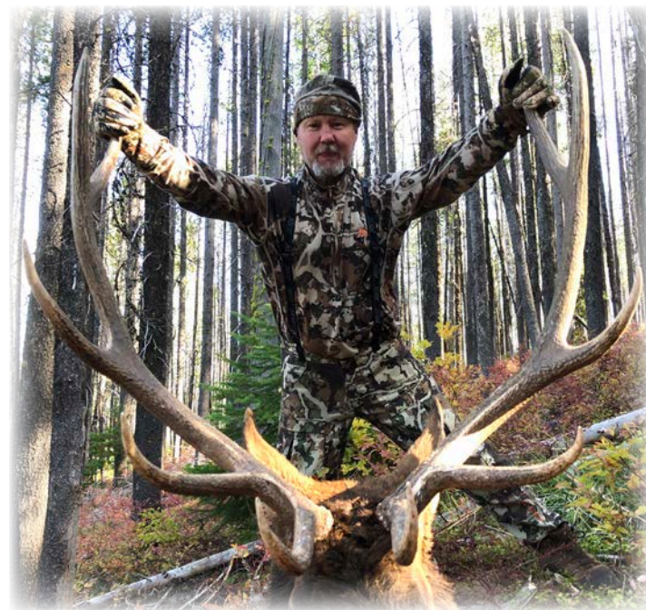
Nothing compares to the excitement of Bugling bulls! Nice job!