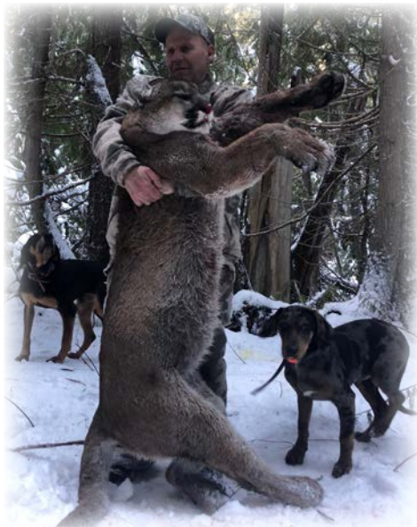
Nothing better then tagging out on your dream hunt!