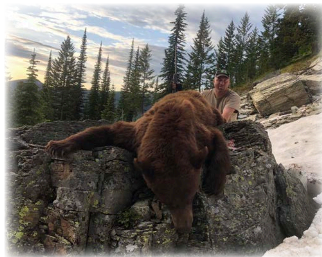
Beautiful scenery with a beautiful bear!