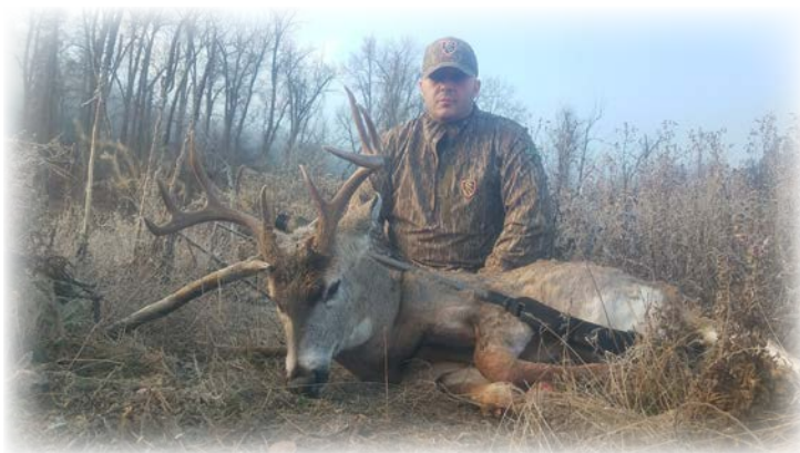
Stud Montana Whitetail