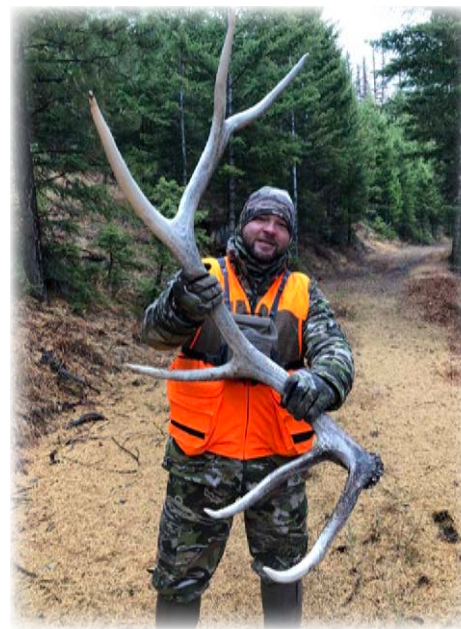
I wonder what this bull looks like this year!