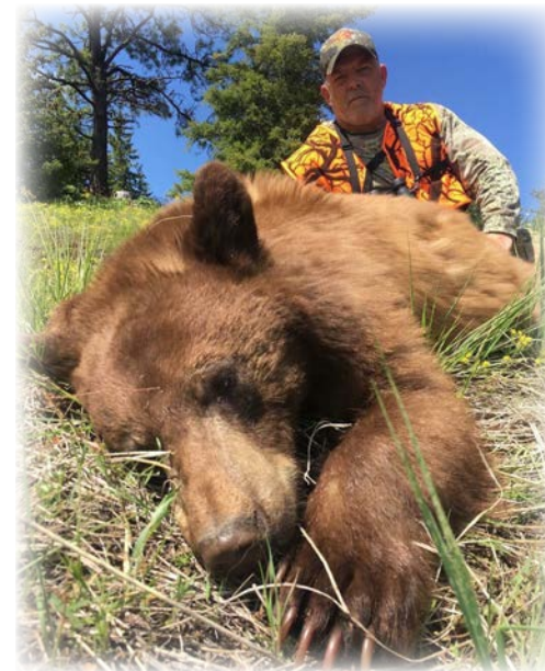
Nothing like a blonde bear.