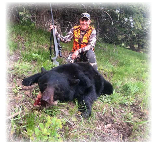
Nothing better then shooting a black bear as your first big game animal.