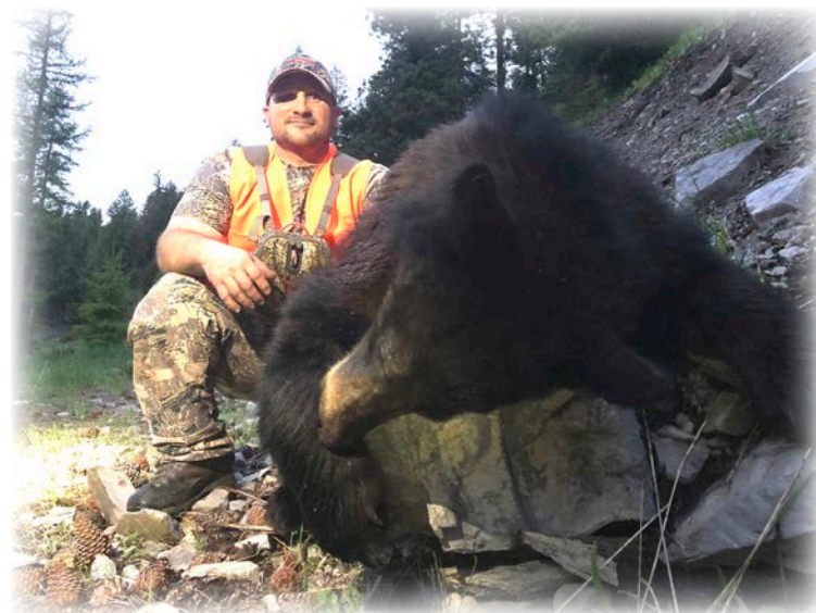
Putting them down!