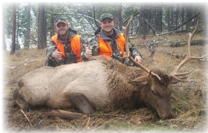
Success is a sweet thing.