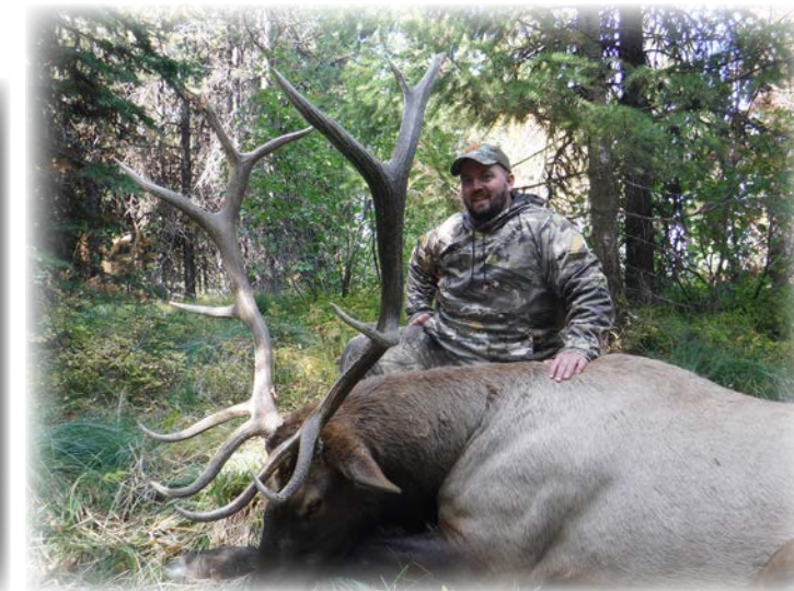
This bull was big in every way. What an amazing Bow kill!