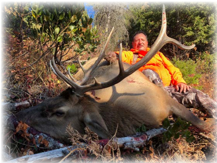
Hardwork pays off!