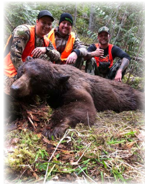
Nothing like sharing great hunts with good friends.