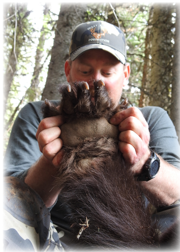
Taking it all in!