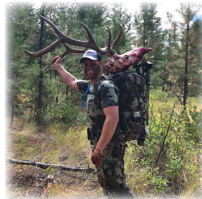
Enjoying the pack out!