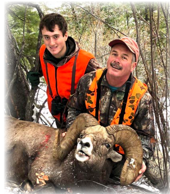
Can't beat this Father/Son hunt.