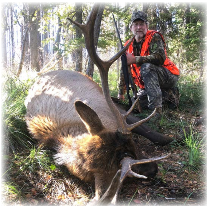
Grinning ear to ear!