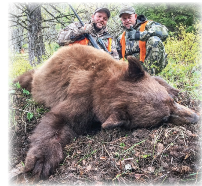
Oscar, another great color phase bear.