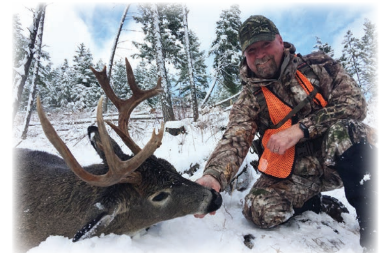
Another nice late season whitetail.