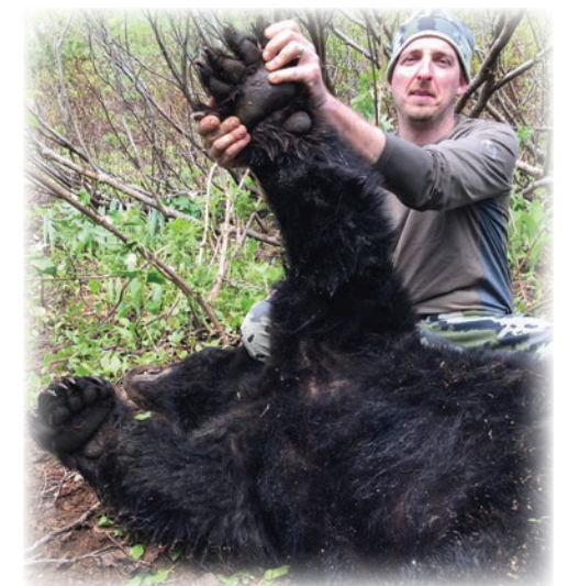
Look at the paw on that thing!