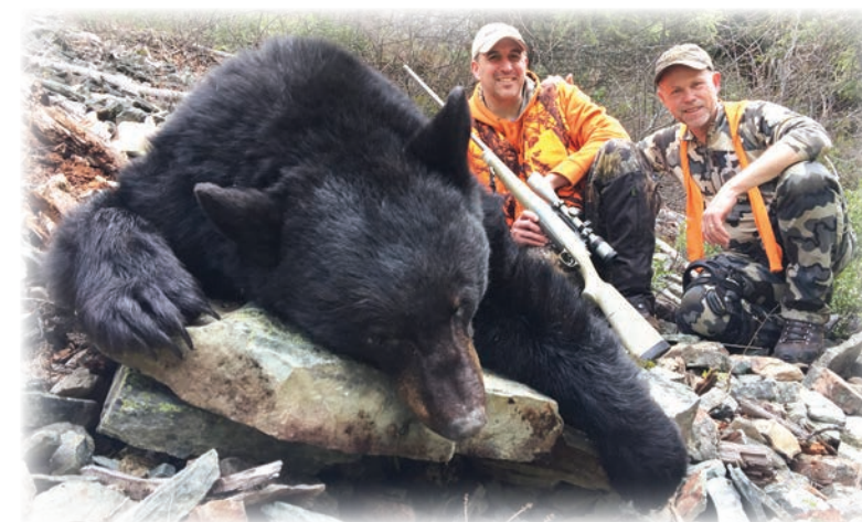
Another great representation of the bears Montana has to offer.