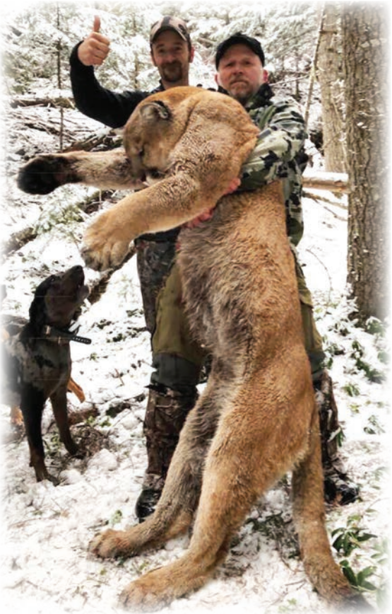
Brian killed this giant B&C tom.

All animals in this harvest report were harvested in the 2017 hunting season. Not all animals could make it in the 2017 report.