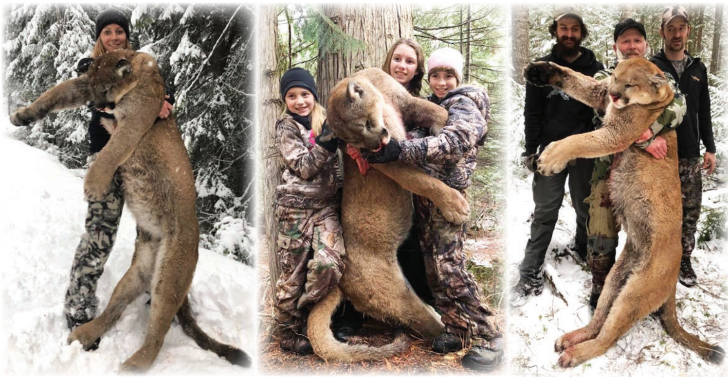
We killed three giant lions in only three days of hunting.