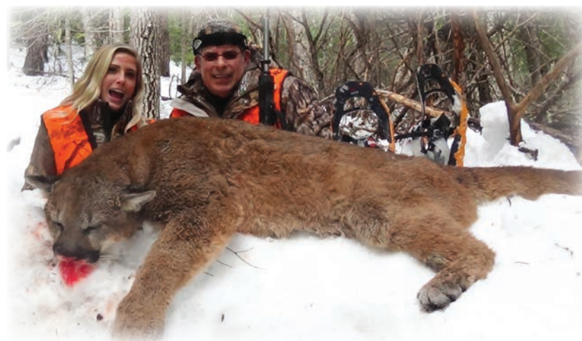
Sydney, PA killed her first lion ever!