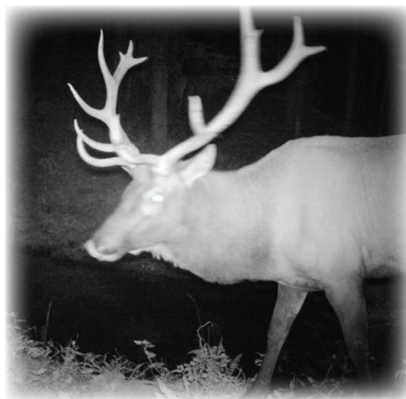
Chris put a nice shot on this bull while it was still in its bed!