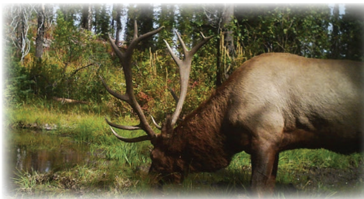
We put out a ton of cameras to scout out these bulls in the off season!