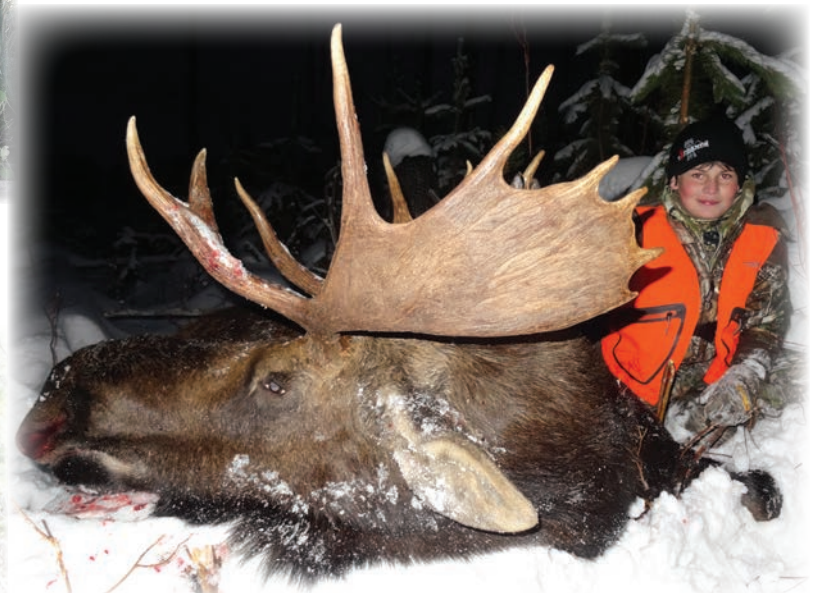
Boden at only 12 years old drew the super tag for moose and made a great shot on this bull.