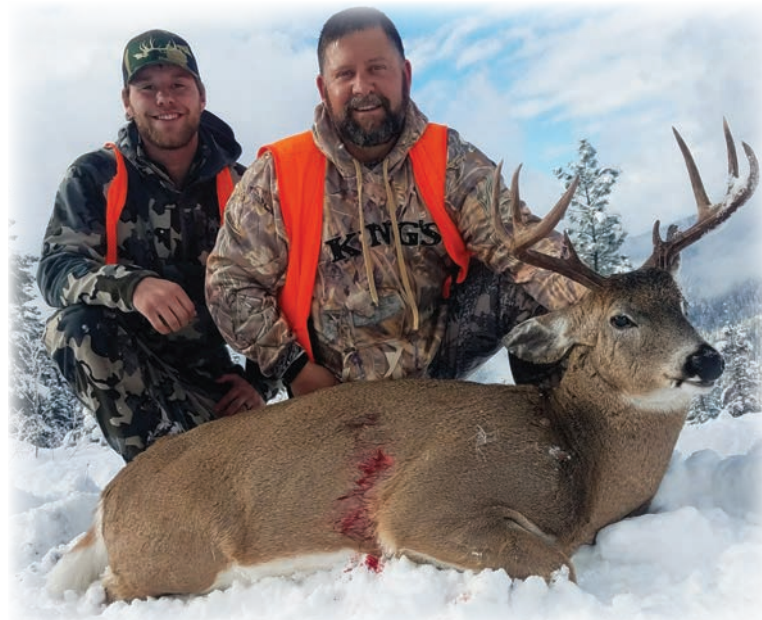
Dennis, Montana is a great place to hunt rutting whitetail with a rifle.