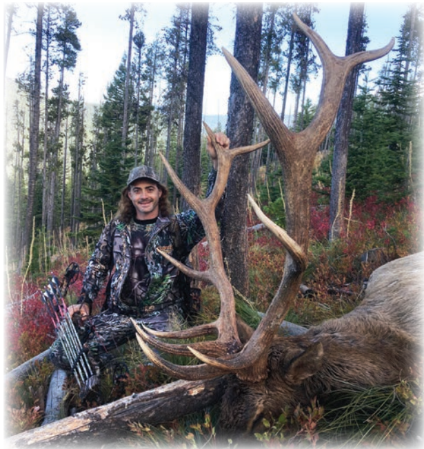
Montana produces some monster bulls.