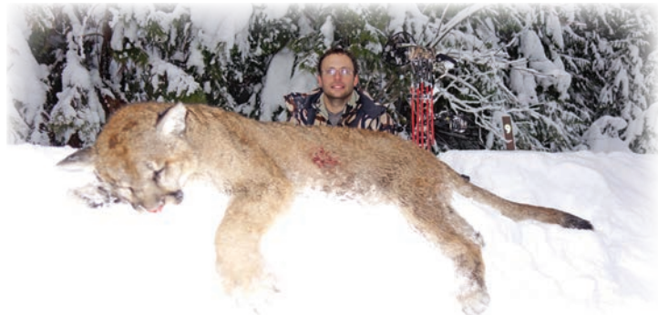
Another nice tom.