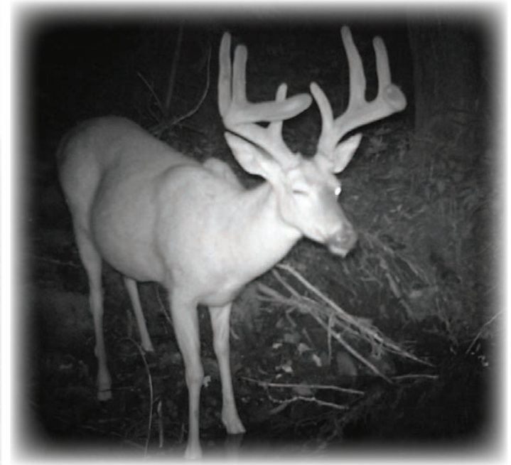
He must be winking at that doe behind the camera