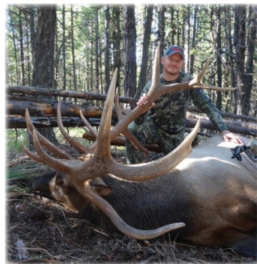
Droptine bulls are super rare! we got two in week!