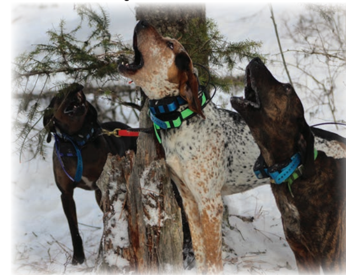
The dogs have one treed