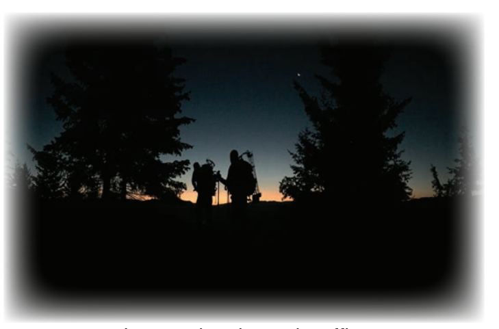
Just another day at the office