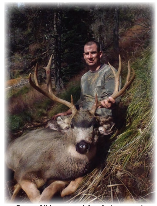
Brett, NY camped for 3 days and killed this exceptional buck