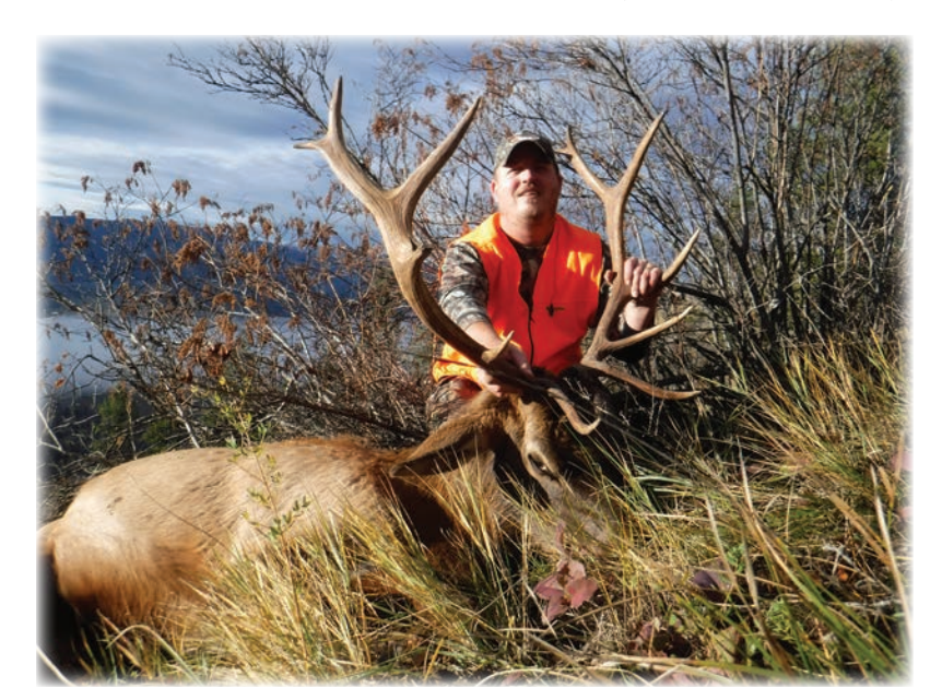
Ryan, VA with this great 6 point bull