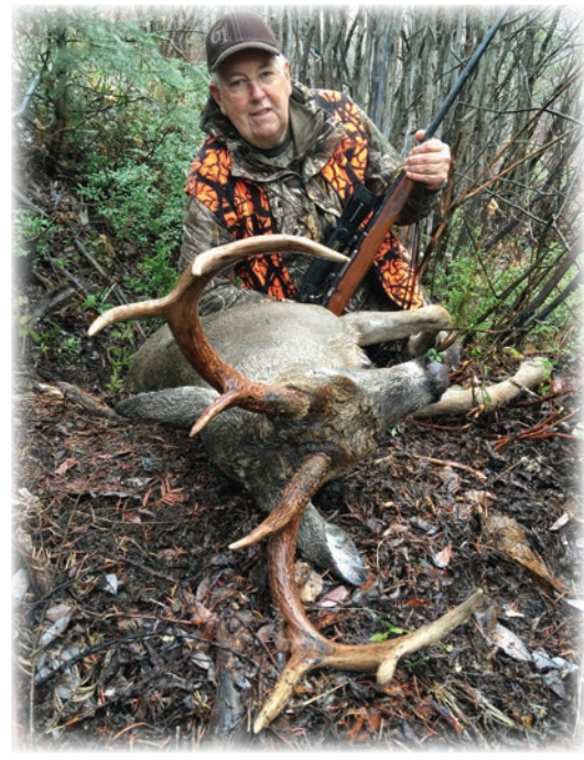
Dennis, NY Hunting rutting whitetails pays off again