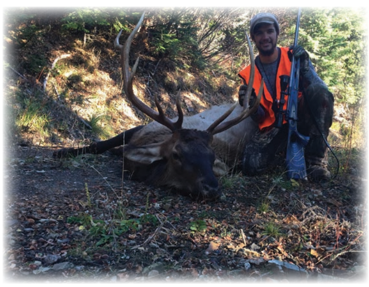
Eugene, NY with a great bull