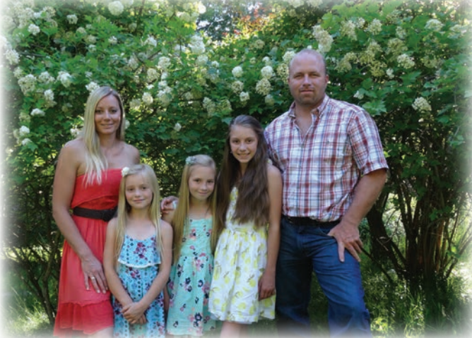
The Carr Family