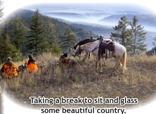
Taking a break to sit and glass some beautiful country.