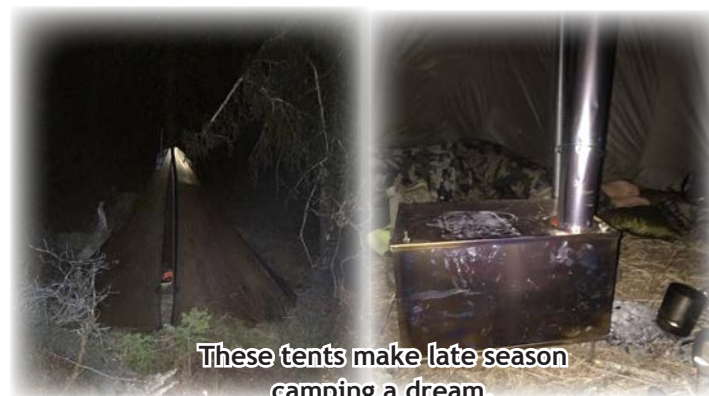
These tents make late season camping a dream.