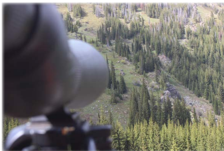
Glassing up some spring bears.