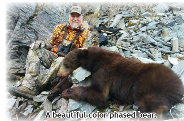
A beautiful color phased bear.