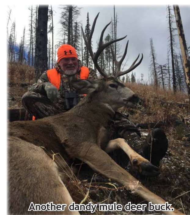
Another dandy mule deer buck.