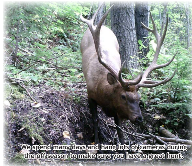
We spend many days and hang lots of cameras during the off season to make sure you have a great hunt.