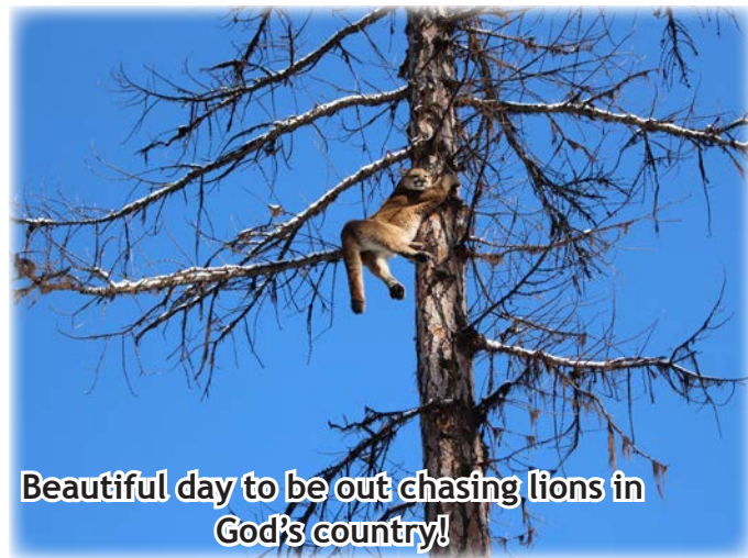
Beautiful day to be out chasing lions in God's country!