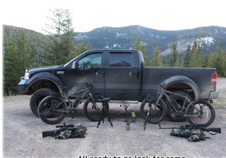
All ready to go look for some spring bears!