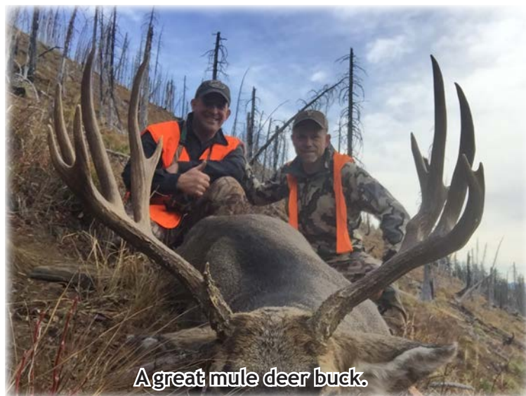
A great mule deer buck.