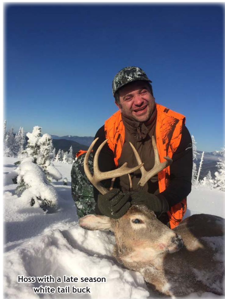
Hoss with a late season white tail buck